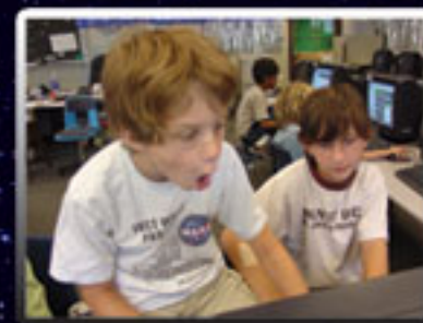
Spring Break Camp